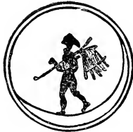
REPRESENTATION IN GYFFYN CHURCH, NEAR CONWAY.

would have said "the thief," for stealing appears to be more antique.